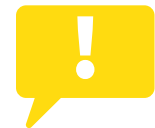
Identify & manage risks